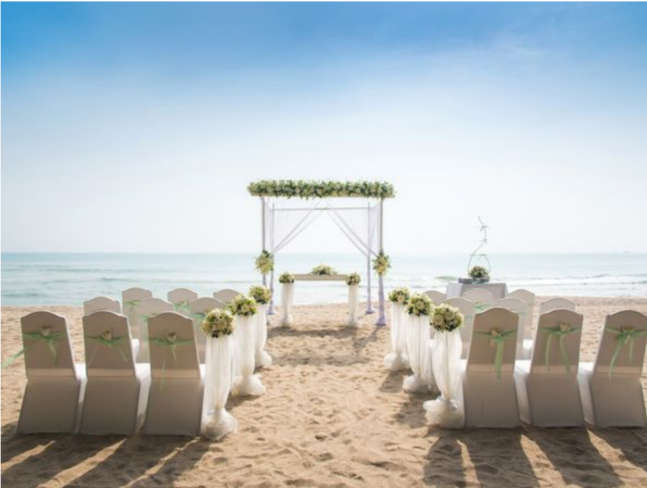
Best Caribbean Beaches for Weddings