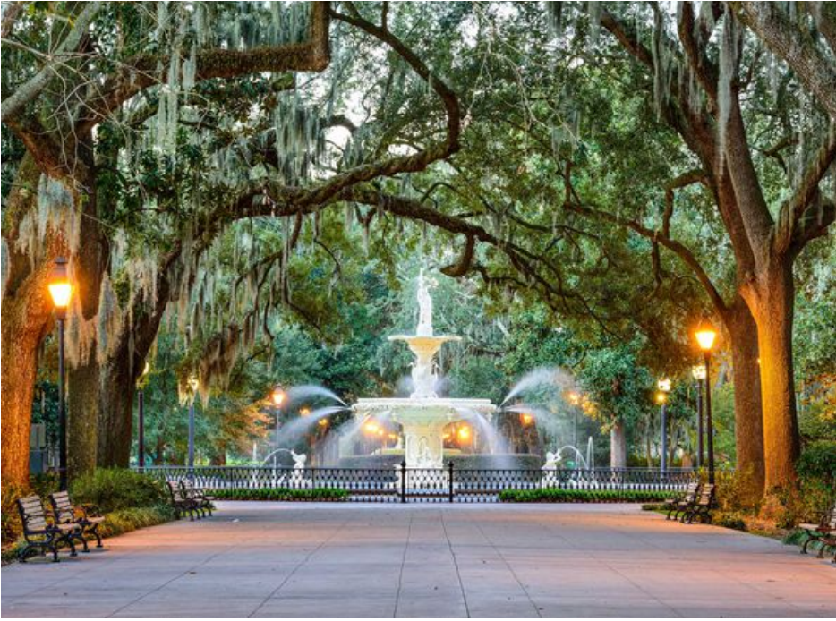
Best Places to Get Married in the U.S.